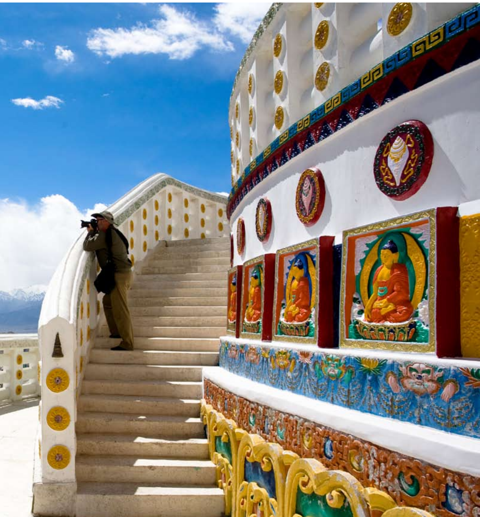
Shanti Stupa, Leh, Ladakh, India, 2008 Canon 5D, 17mm, 1/320 @ f/10, iso 100

Photographer Matt Brandon shooting out over the valley in Leh. This framing, and the ability to get Matt within the colourful context of the Shanti Stupa, was possible only with a wide angle lens and getting close. Really close.