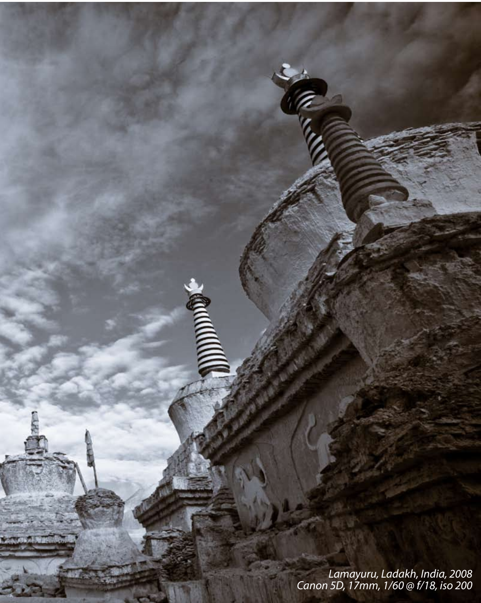
Lamayuru, Ladakh, India, 2008 Canon 5D, 17mm, 1/60 @ f/18, iso 200