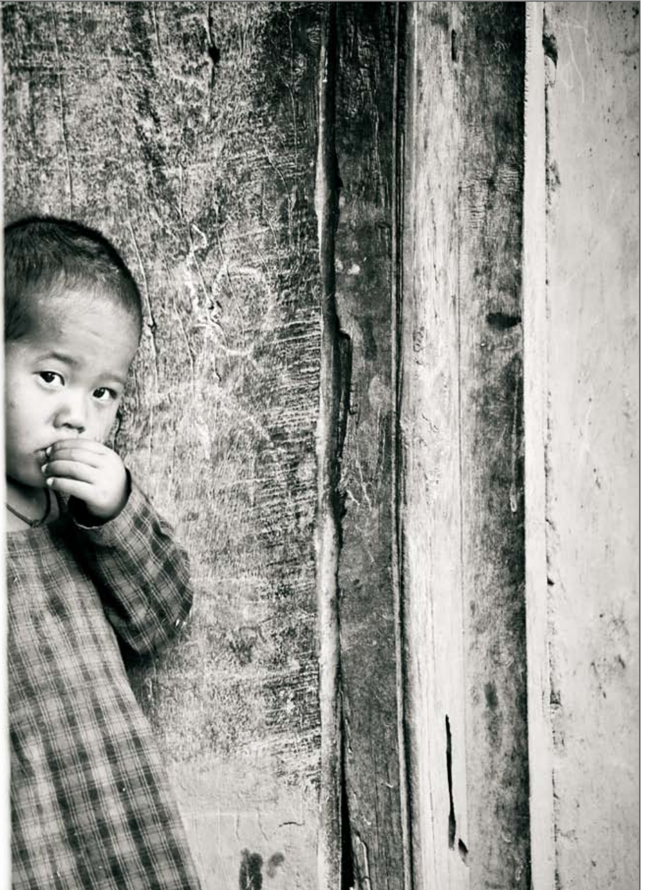
Kathmandu, Nepal, 2008 Canon 5D, 200mm, 1/125 @ f/2.8, iso 100