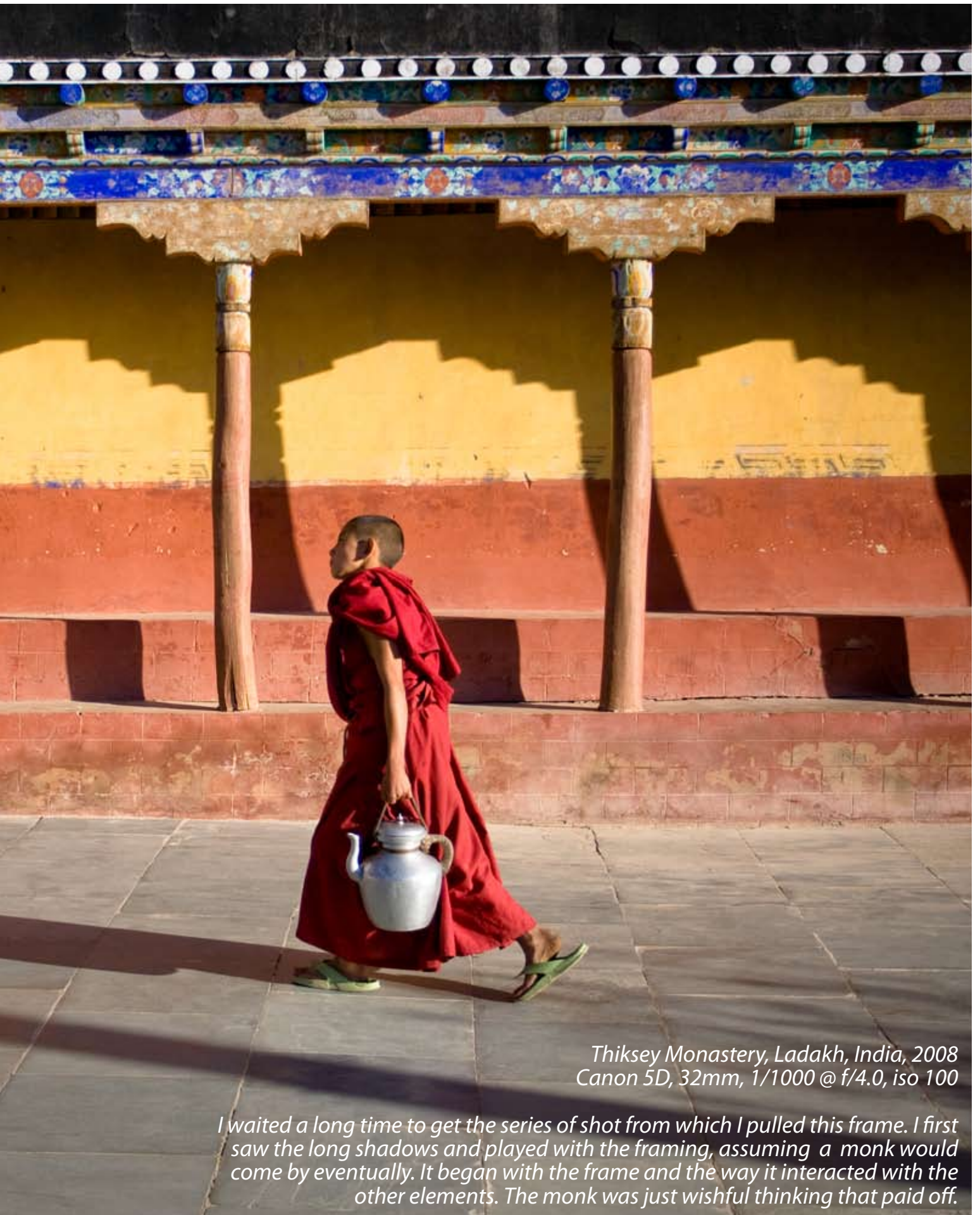
Thiksey Monastery, Ladakh, India, 2008 Canon 5D, 32mm, 1/1000 @ f/4.0, iso 100

I waited a long time to get the series of shot from which I pulled this frame. I first saw the long shadows and played with the framing, assuming a monk would come by eventually. It began with the frame and the way it interacted with the other elements. The monk was just wishful thinking that paid off.