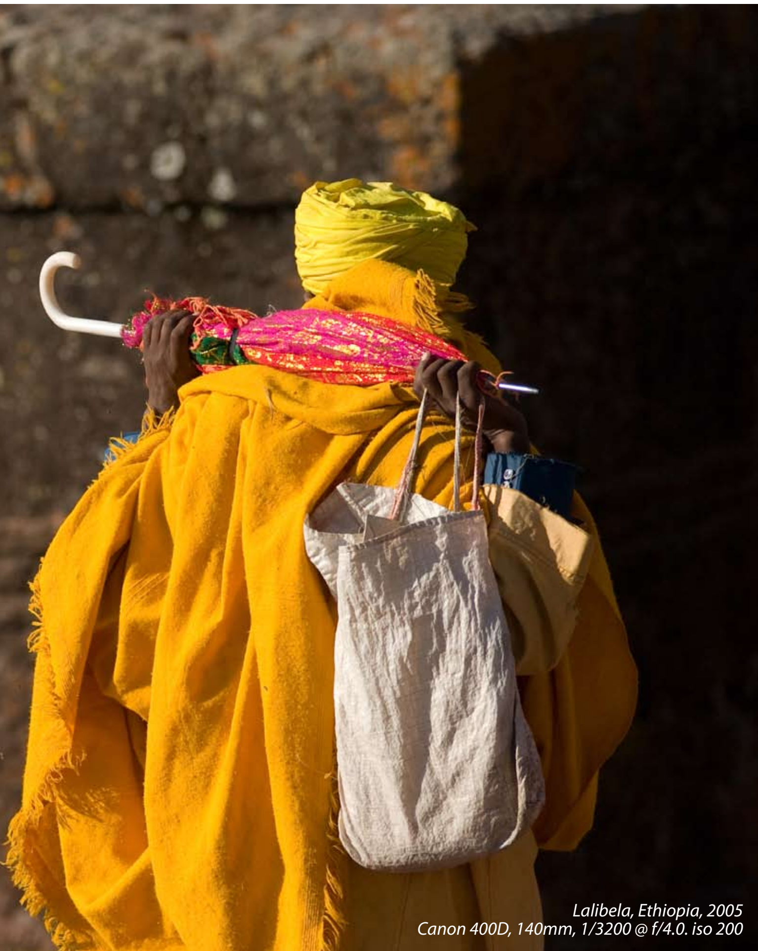
Lalibela, Ethiopia, 2005 Canon 400D, 140mm, 1/3200 @ f/4.0. iso 200