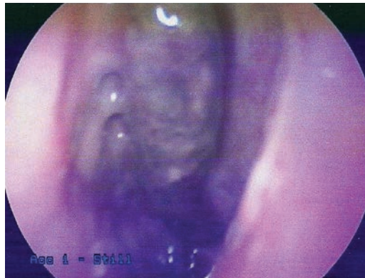
Figure 2. Endoscopic image showing necrosis of the middle turbinate.